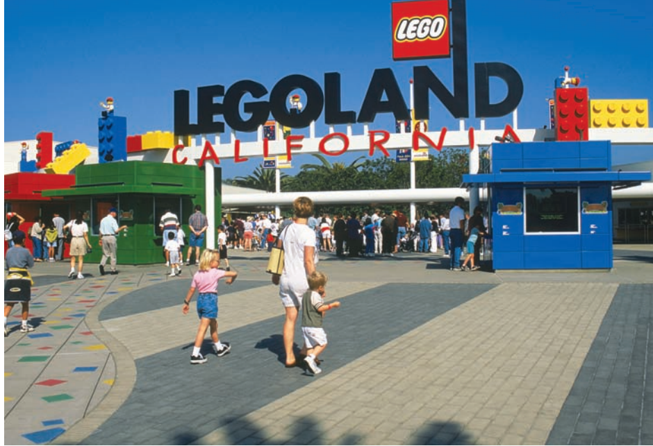
LEGOLAND® CALIFORNIA attracts over 1 million visitors each year.

of the United States, there are about 300 amusement parks in Europe, and the industry is growing in Asia. In fact, according to the International Association of Amusement Parks and Attractions, four of the top ten grossing parks in the world are in Asia. Tokyo Disneyland, which celebrated its twenty-fifth anniversary in 2008, draws more visitors than almost any other park in the world (17 million), second only to Disney World, and is successful despite the difficulty that theme parks in Japan have had over the last few years. Hong Kong Disney Land is Disney's most recent venture in Asia.