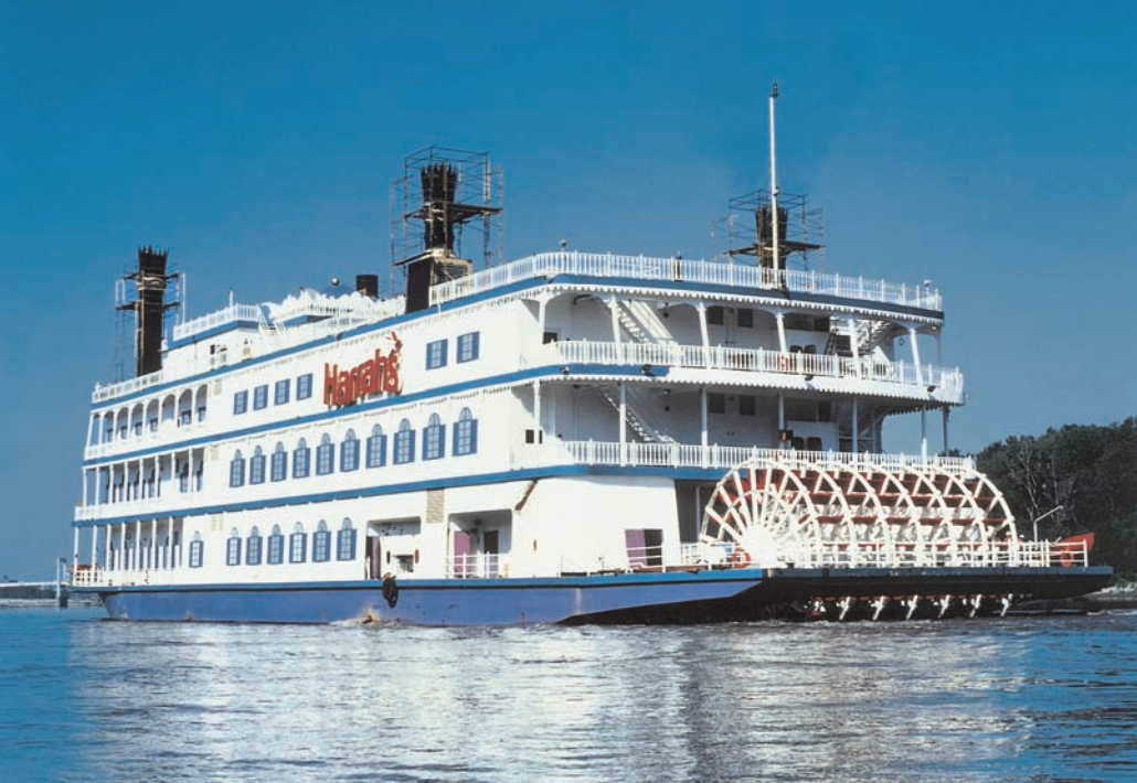
Harrah's operates this riverboat casino on the Missouri River in North Kansas City.

legitimate form of entertainment rather than something that is done only by people of questionable background.