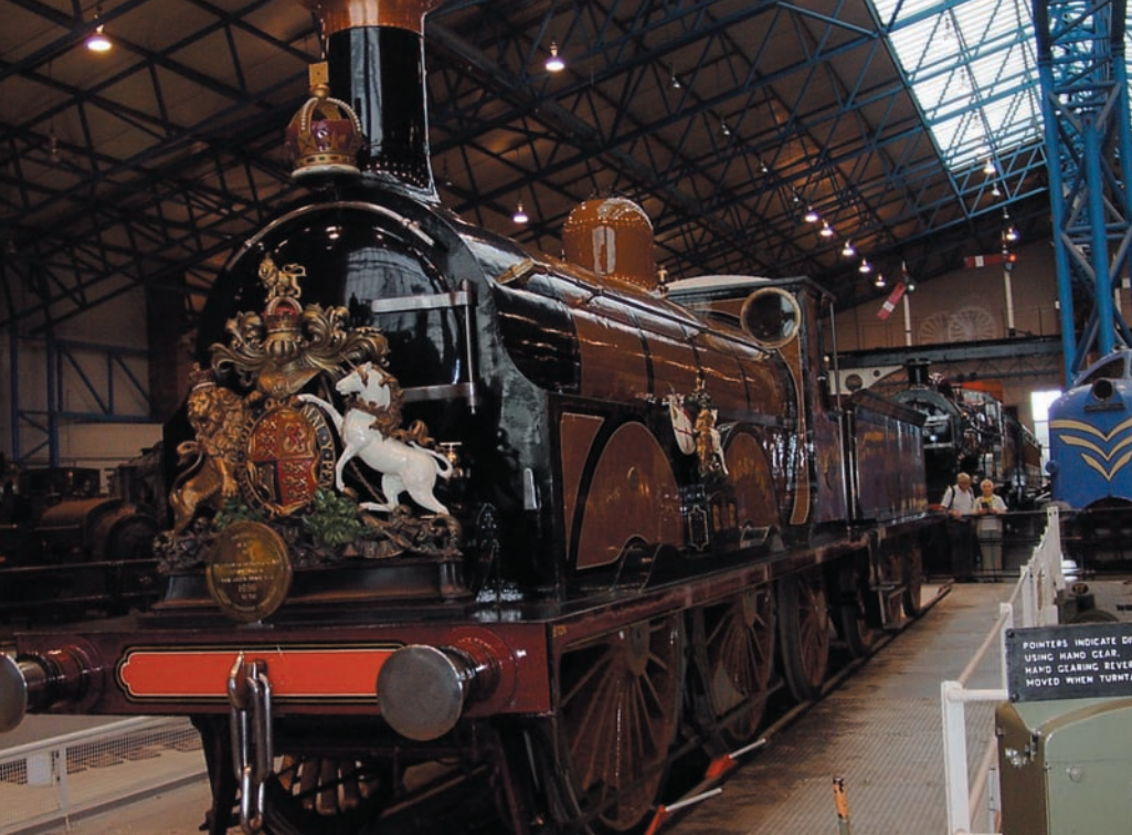
A vintage locomotive (1882) at the National Railway Museum in York, England.

Luxury hotels, such as those located at MGM MIRAGE's CityCenter, are part of what has turned Las Vegas into a huge tourist destination.