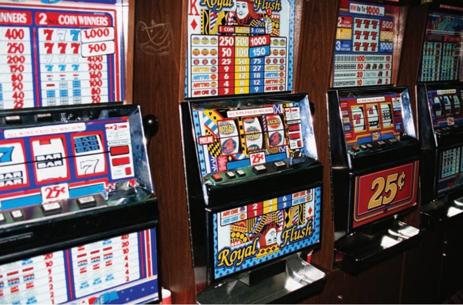
Casinos offer many different types of games to attract different demographics of players.

Atlantic City is quite different from Las Vegas, aside from being a much younger gaming destination. Although there are two major cities within a day's drive of Las Vegas, Los Angeles and San Diego, Atlantic City has one-quarter of the U.S. population within a 300-mile range. New York City, Philadelphia, and Washington, D.C., are all within 150 miles. Over two-thirds of Atlantic City's visitors arrive by car, and just one-fourth arrive by motorcoach. Few, in comparison, arrive by rail or air.