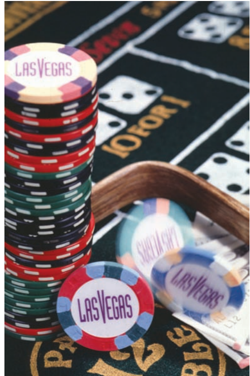
Las Vegas is still the most popular gaming destination in the United States.

Three primary forces appear to be driving the current growth in gaming. The first is a change in consumer tastes in which people have come to see gaming as a