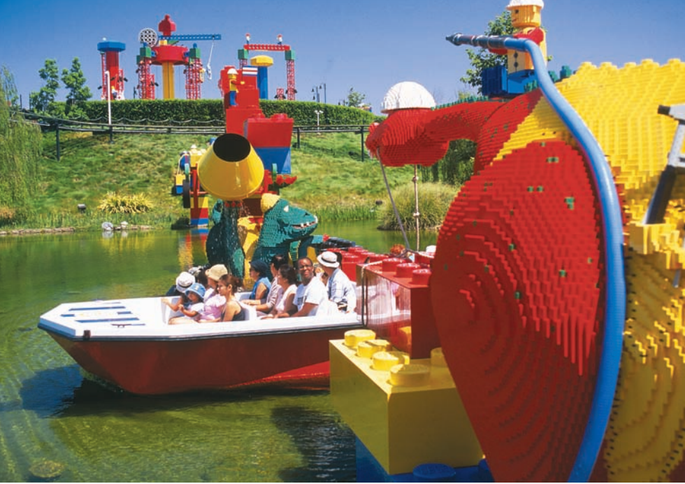
A boat ride takes visitors by sculptures built of LEGO® blocks.

Some parks are built around one general theme. LEGOLAND, for instance, is built around the LEGO toy that originated in Denmark. LEGOLAND California is one of four LEGOLAND theme parks around the world (others are in Denmark, England, and Germany); another is opening in Orlando in 2011. The park has some 5,000 models built from LEGO blocks, including entire replica cities (such as New Orleans and San Francisco). The park attracts over 1 million visitors each year, mostly from southern California.