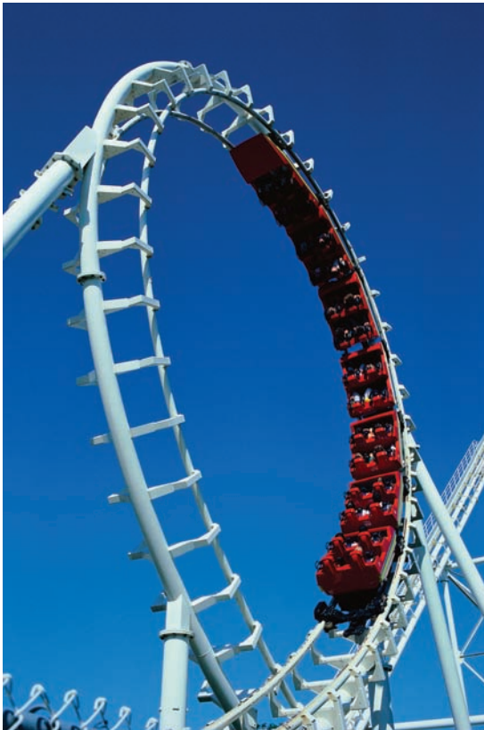
Roller coasters continue to be a popular attraction at theme parks both large and small.

Regional parks, aside from serving a smaller geographic area than parks such as Disney World, often target particular groups in their marketing. For instance, Six Flags Over Georgia offers special parties for high-school graduating classes, and its annual Gospel Jubilee features top Christian talent that might not be as popular in other regions of North America. In Pigeon Forge, Tennessee, near Knoxville, Dollywood re-creates the Great Smoky Mountains of the late 1800s through crafts and country music as well as atmosphere, old-time home-style food, and rides. Dollywood has a host of special events in addition to its attractions. These include the National Gospel & Harvest Celebration as well as holiday celebrations, craft competitions, and performances. There is even a church on site with non-denominational services held every Sunday. Regional